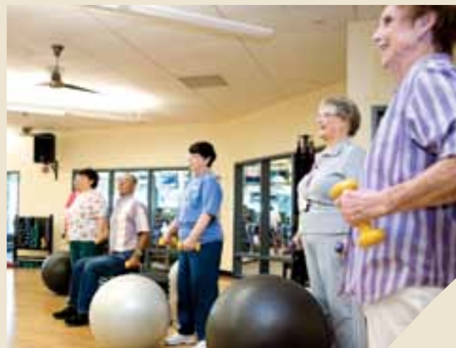
Balance and coordination class participants

To join Evolutions Fitness and Wellness Center and receive a free fitness evaluation, call 559.685.3800.